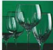
Lenox Solitaire and Firelight patterns.

Lenox will add new shapes to its Solitaire and Firelight collections: a balloon and all-purpose stem. Both of these stems feature bowls that are more generous in size than what is currently available. These larger shapes, according to Lenox, have been added to "keep in line with the changing desires of our consumers." The suggested retail on the Solitaire stems is $35, and Firelight is $48.