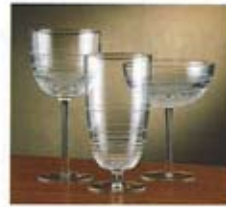
L to R: Colorful Glassware from Bormioli Rocco, Dansk Centric and Libbey Gatherings.